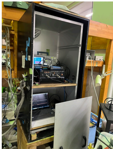
equipment for quench experiments